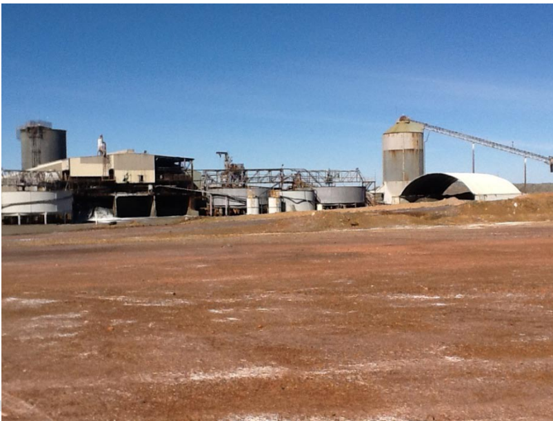
Figure 1 Thalanga Processing Plant